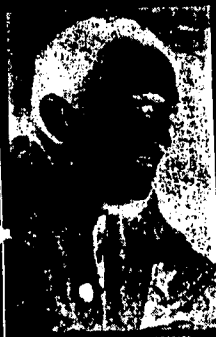
J. EDGAR HOOVER